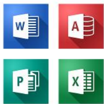
Office 365 Suite

Manage all of your Office 365 services from a single sign-on console that shows you everything you need to know about your accounts and users, including the ability to protect company data by enforcing your security policies and remotely wiping devices if necessary. Take your Office 365 experience into the cloud today to see how much farther your business can go.